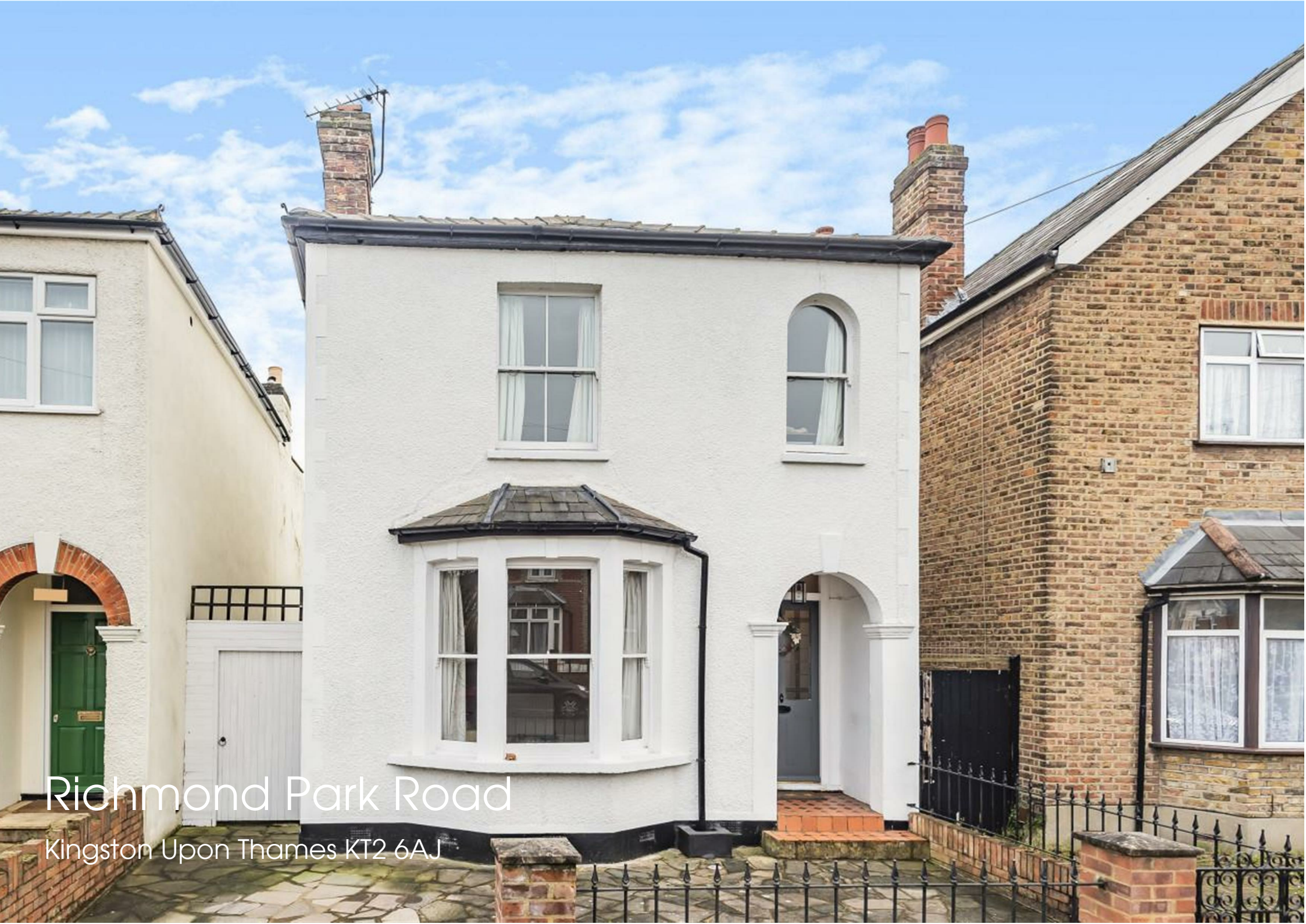
Richmond Park Road Kingston Upon Thames KT2 6AJ